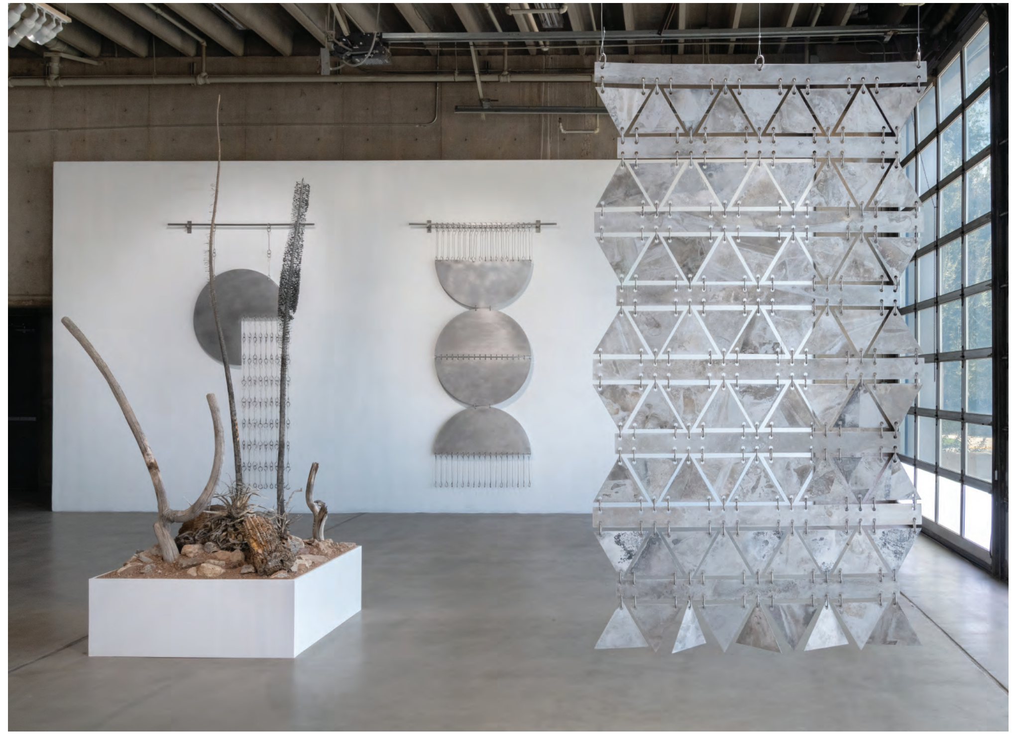
Museum of Contemporary Art Tucson