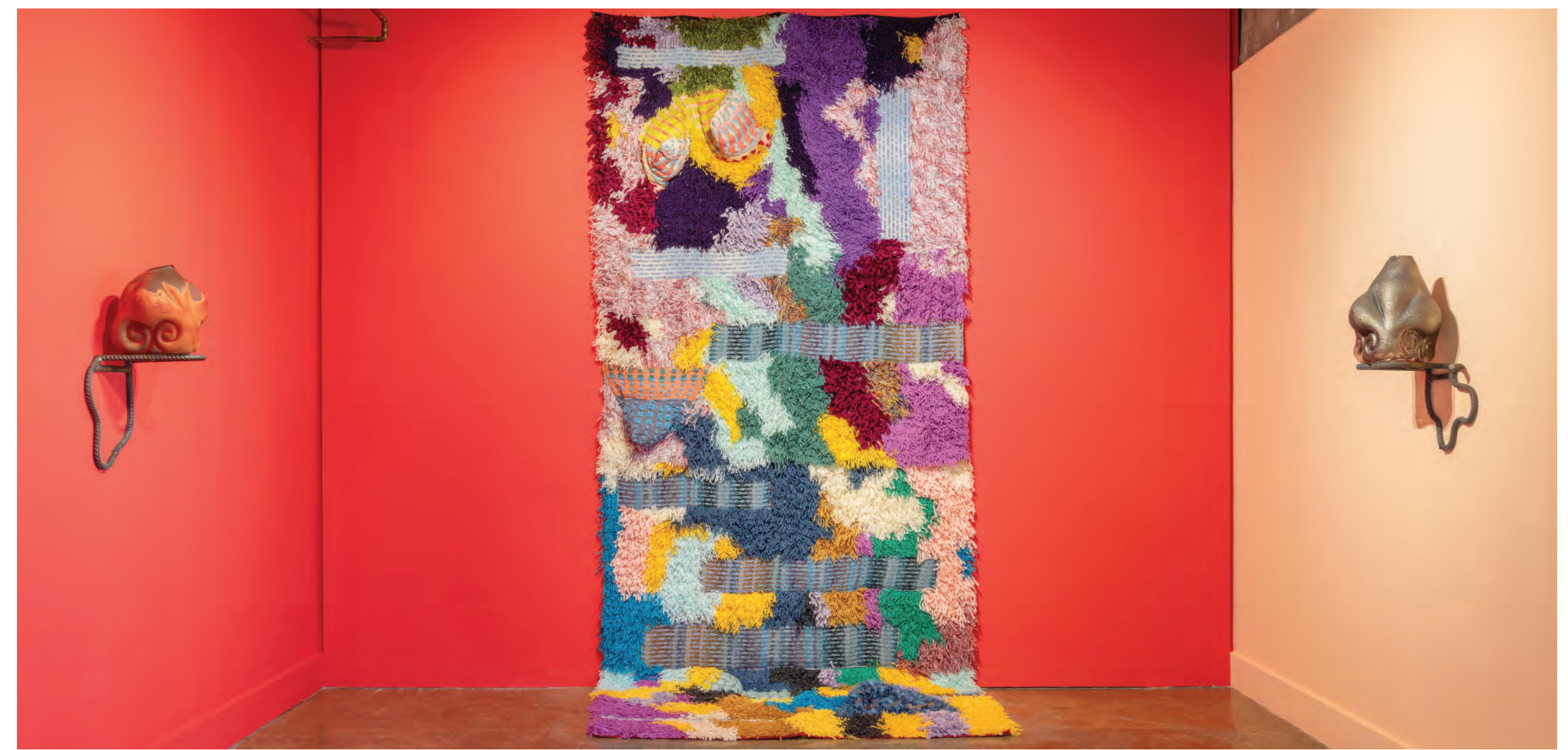
Installation view, Sara Hubbs & Sarah Zapata: Between gravity and ground, MOCA Tucson, 2024.

MOCA Tucson is the leading, artist-centered contemporary art institution in the Southwest. We believe that art has the power to change the world. We cultivate critical dialogue between artists and audiences about today's world; support artists through the production and presentation of new, experimental work; and resource the artists and audiences of tomorrow.