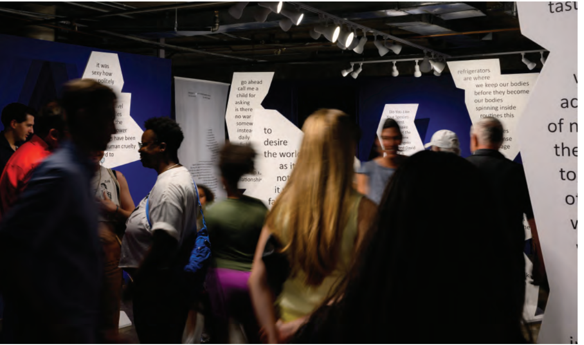
Opening reception, CAConrad: 500 Places at Once, MOCA Tucson, 2024.

Urgent Care Art by Lex Gjurasic and Eli Burke