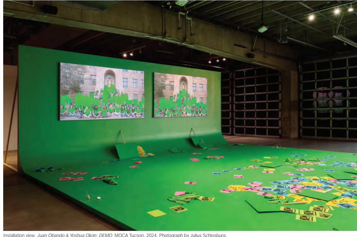
Installation view, Juan Obando & Yoshua Okón: DEMO, MOCA Tucson, 2024.