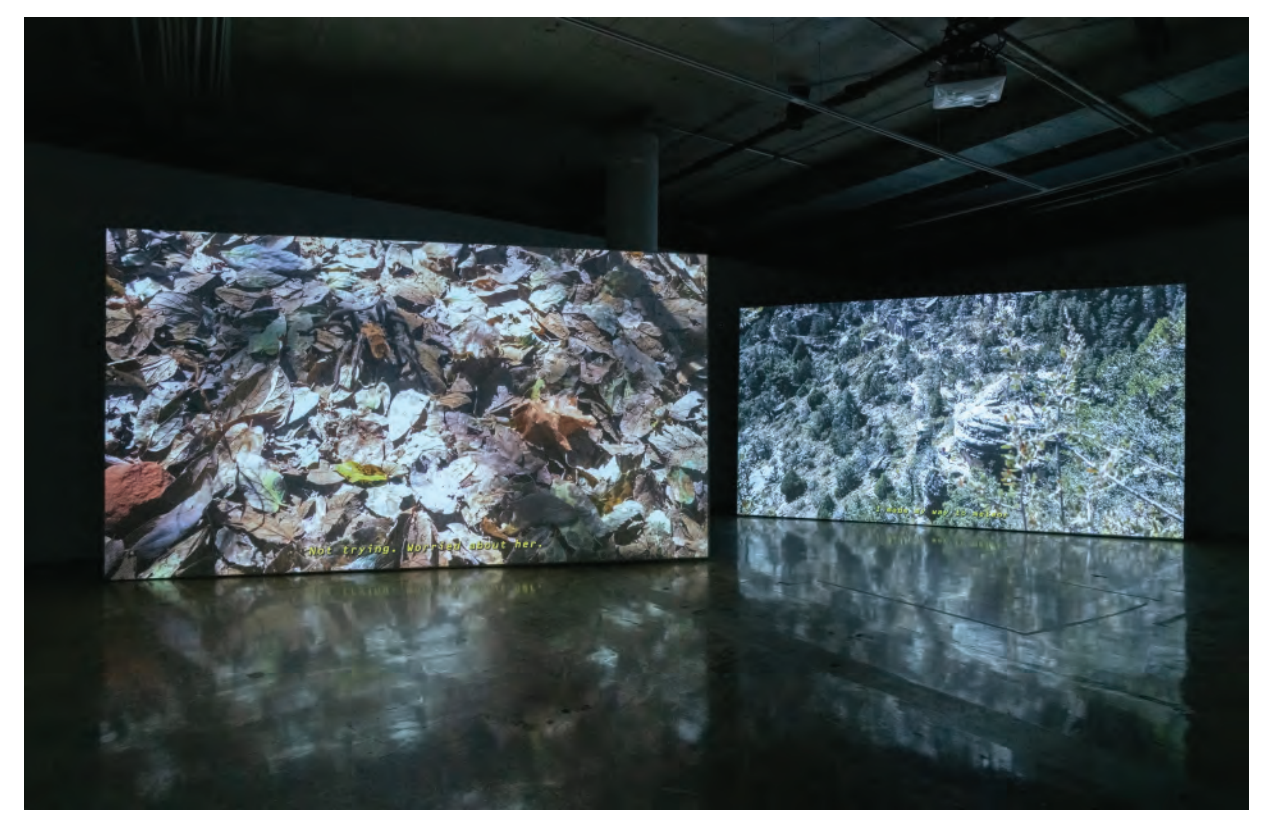
Installation view, Sofia Córdova: SIN AGUA, MOCA Tucson, 2024.

*Obando and Okón presented an iteration of DEMO at the Noorderlicht gallery in the Netherlands and at the Museo Espacio in Aguascalientes, Mexico.