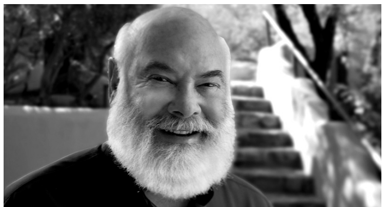
Andrew Weil, M.D.

Reporter, author, and educator, has covered stories on seven continents since the 1960s. Past editor of the International Herald Tribune; special correspondent for the Associated Press; AP bureau chief in Africa, Southeast Asia, Argentina, and France; and founding editor of the quarterly, dispatches. He teaches international reporting at the University of Arizona and is a champion of journalistic integrity.