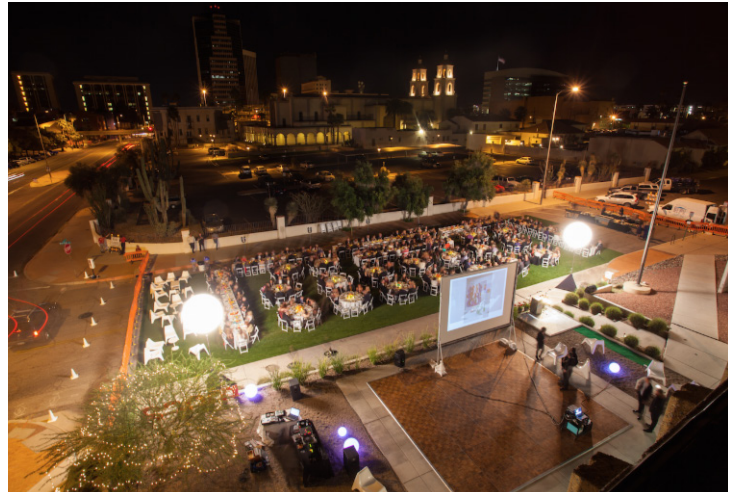
Bird's-eye view of the 2015 MOCA Gala.