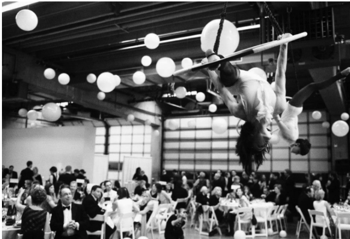
A special performance during the 2013 MOCA Local Genius Awards.